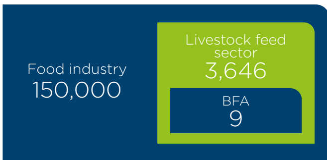
Belgian feed production in figures